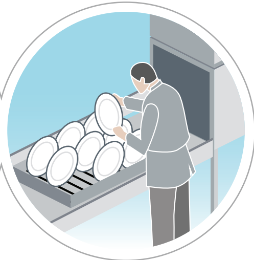
Most dishes and ware can be stacked and put away immediately – no wet nesting.