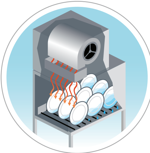
Heat and high-pressure air force water off dishes and ware.