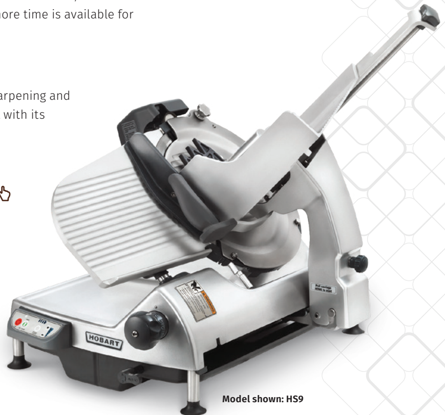
Model shown: HS9