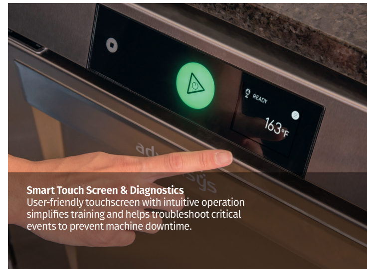
Smart Touch Screen & Diagnostics User-friendly touchscreen with intuitive operation simplifies training and helps troubleshoot critical events to prevent machine downtime.