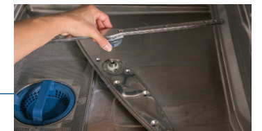
Snap-in, self-cleaning wash and rinse arms make cleaning fast and easy.