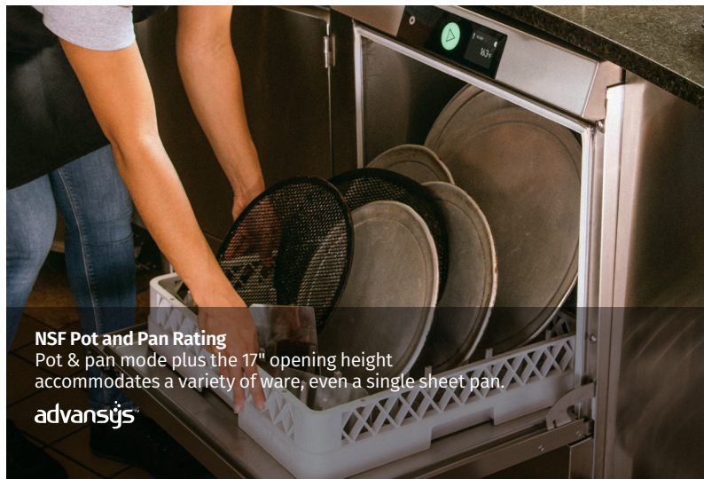
NSF Pot and Pan Rating Pot & pan mode plus the 17" opening height accommodates a variety of ware, even a single sheet pan.