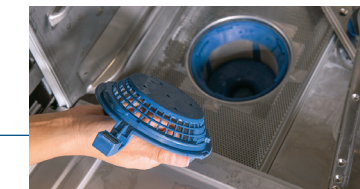
Two-stage filtration helps keep dishes clean and minimizes rewash.