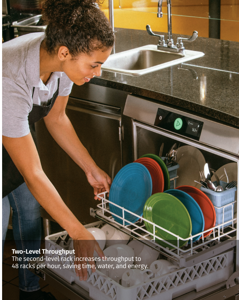
Two-Level Throughput The second-level rack increases throughput to 48 racks per hour, saving time, water, and energy.

Achieve your Hobart Clean with the LXn undercounter dishwasher today.