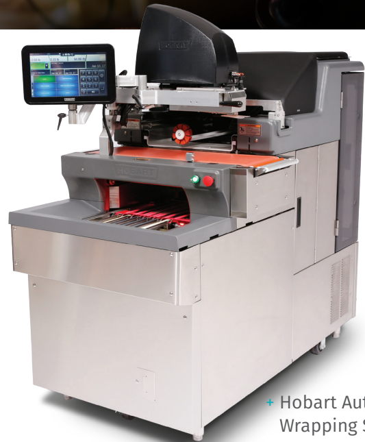
+ Hobart Automatic Wrapping Systems